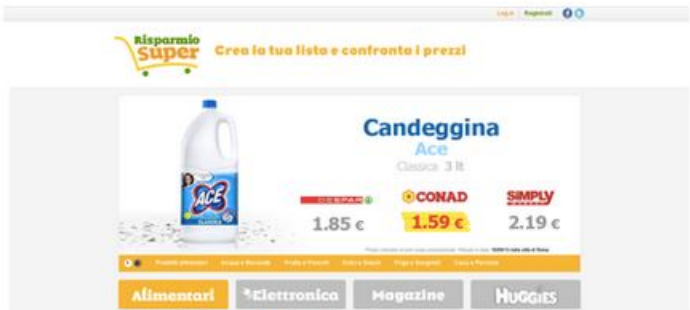
Above: Home Page Uploaded: 4/22/13